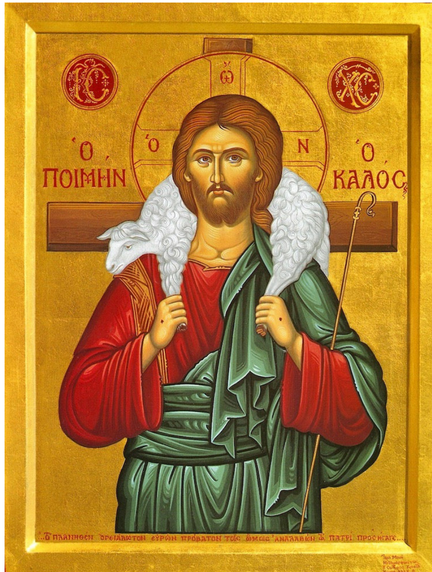
Christ the Good Shepherd Icon