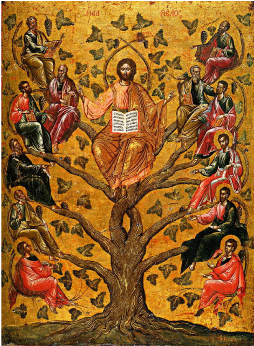
Christ the True Vine icon Athens, 16th century