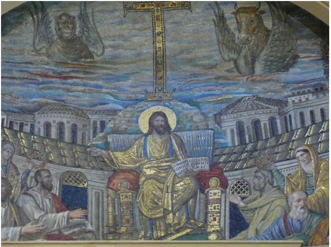
Christ Pantocrator Unknown, c. 410 AD.