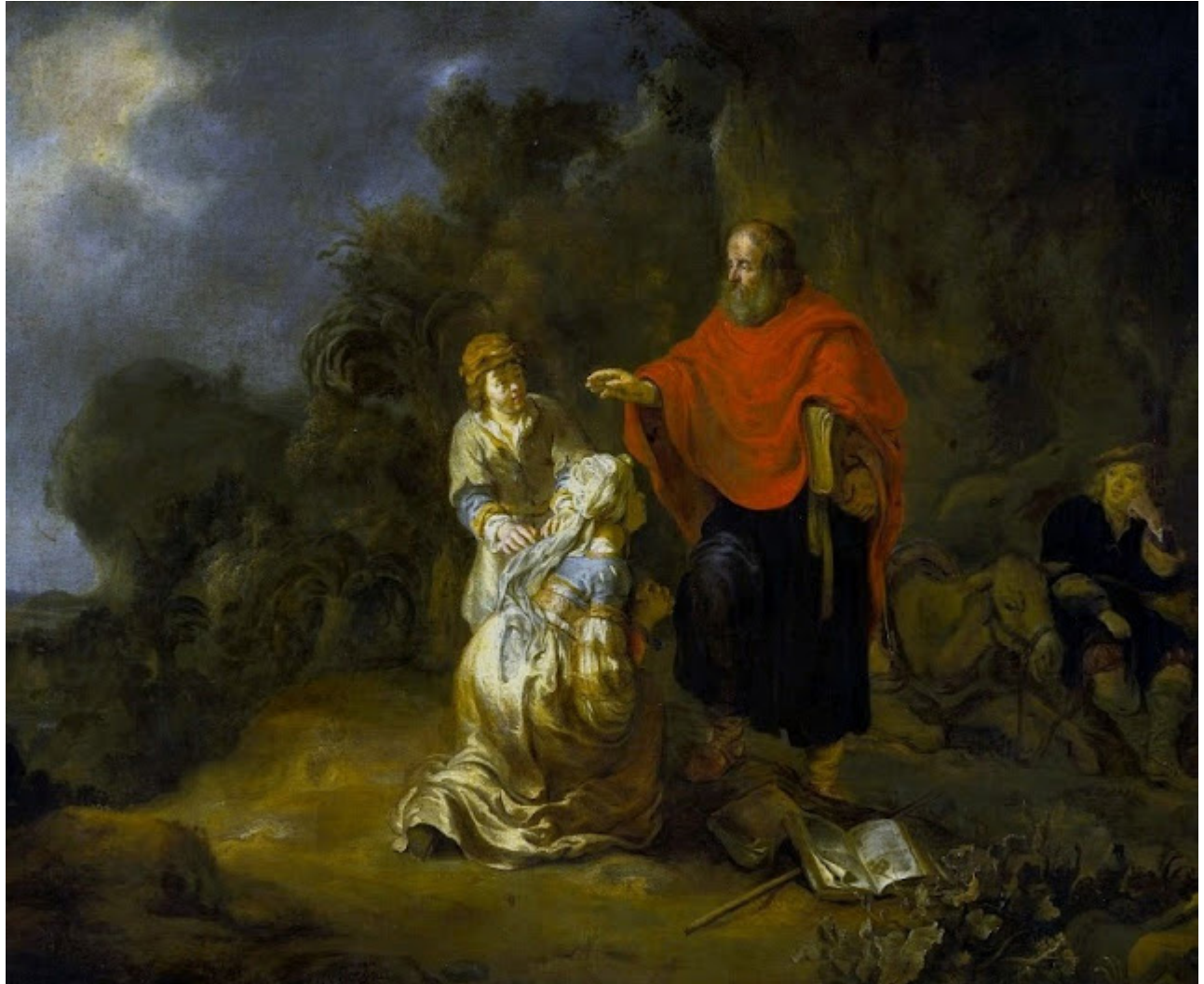
Elisha and the Shunammite woman Gerbrand van den Eeckhout (1621–1674)