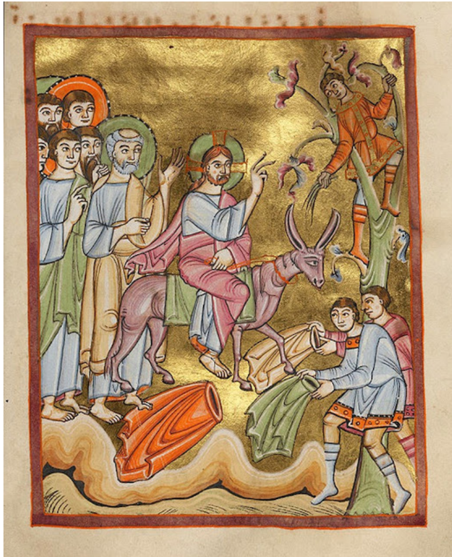
Entry of the King into Jerusalem Unknown - ca.1030-1040